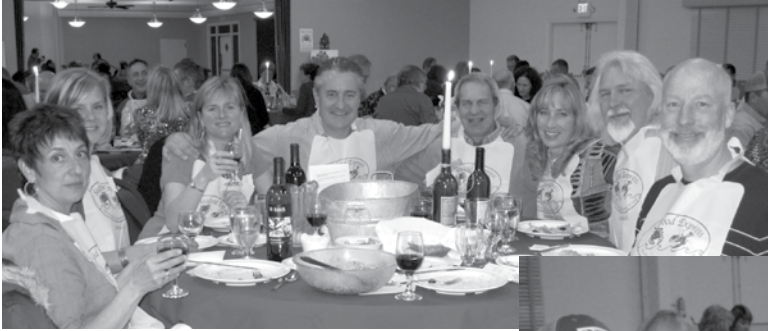
Bokisch Ranches table