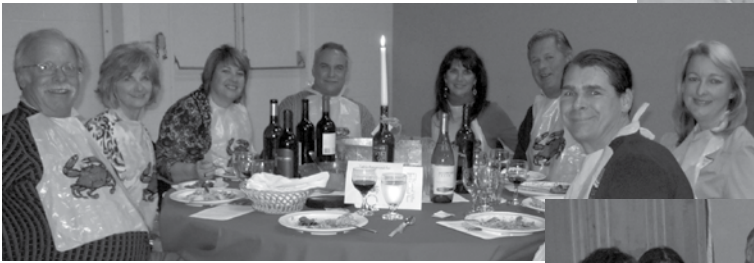
American AgCredit table