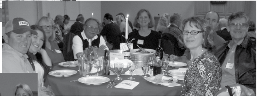
E. & J. Gallo Winery table