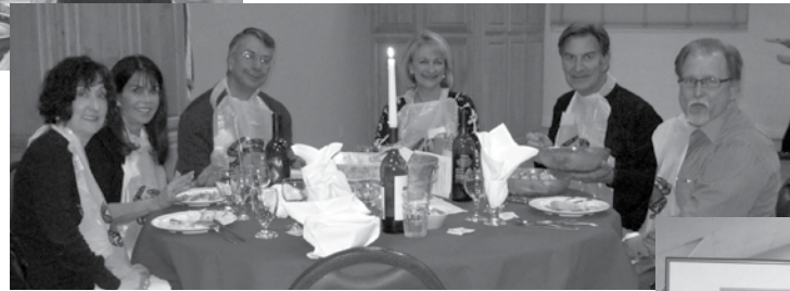
Lewis Engineering table