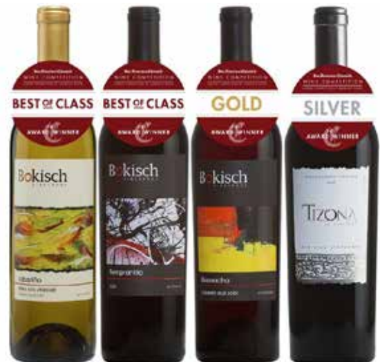
2017 San Francisco Chronicle Wine Competition

Visit www.bokischvineyards.com to learn more.