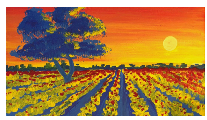
Friday, September 20, 4-7 PM Bokisch Vineyards, Lodi

Join us for a festive Friday night! Watch the sunset over the grapevines at the beyond beautiful Bokisch Vineyards. Sip a glass of award-winning Spanish varietal wine. Munch on tasty tapas (that's Spanish for appetizers). And of course, make your own incredible painting of the view — no artistic talent or experience needed! You can even customize the colors on your painting if you'd like (those who attended last year can start their own multi-color masterpiece series). It's a night you'll never forget! Perfect for girls night out, date night, or just need to get out of the house night.